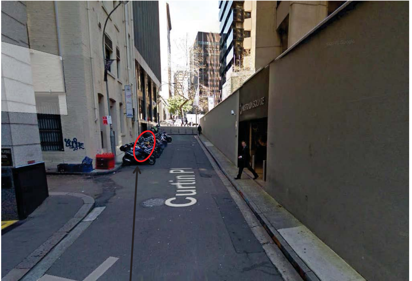
Proposed Works Zone